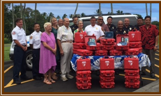
The Kaimas Foundation with the Max and Yetta Karasik Foundation at the HPD AED donation event on August 16, 2016

Hawai'i Island became a safer place to live in 2016 thanks to our donors and a partnership with Big Island Toyota. Hilo Medical Center Foundation donated 33 automated external defibrillator (AED) devices to the Hawai'i Police Department and an additional 20 AED devices to local non-profit organizations across the island. Each AED recipient received FREE chest-compression-only CPR and AED use training for staff and local community members.