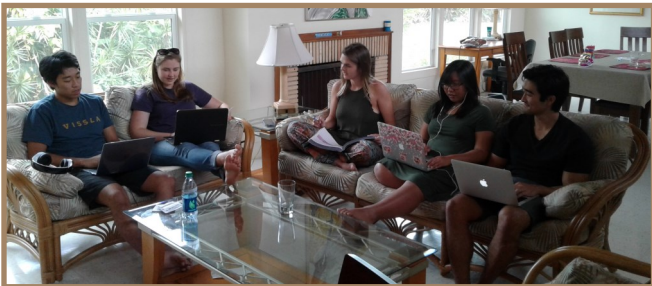
JABSOM First year medical students study at the River Cottage on the Hilo Medical Center Campus during a 2- month rural rotation to Hawai'i Island.

Hilo Medical Center Foundation is proud to support housing for medical students and resident doctors who come to Hawai'i Island on rural rotations to work with local healthcare providers.