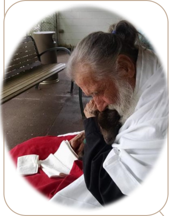
Pictured above: A long-term care resident enjoying a cuddle with "Henry Huggins Goatie"; one of the baby goats that visit the long-term care facility twice per month.

HMC Regional Board continues its commitment to providing long term care services for the East Hawai'i safety net population. Hilo Medical Center will continue to operate a 27 bed facility to care for our communities most at risk populations.