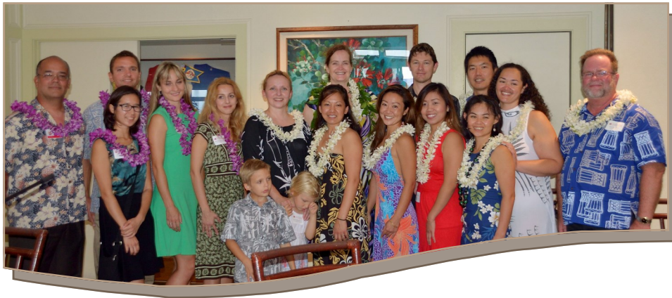
The Hawaii Island Family Medicine Family Residency Program welcomed their third class of residents on July 1, 2016

The program is helping create physicians with the skills to care for patients in rural Hawaii, developing the workforce we need.