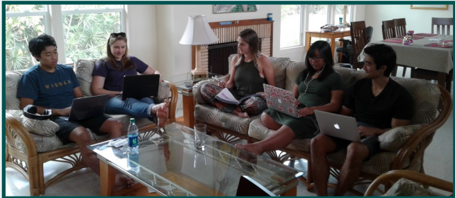
JABSOM First year medical students study during a 2-month rural rotation to Hawaii Island.

Providing Housing and Transportation to Support Rural Rotations